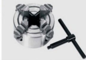
4-jaw chuck (independent)with flange