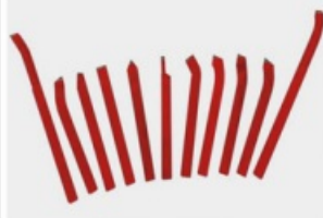
Cutter 11 pieces set