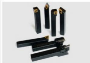
Cutter set (tips replacement)8×8mm